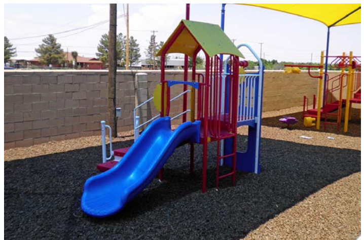
New playground equipment was installed at the COPE shelter this winter.